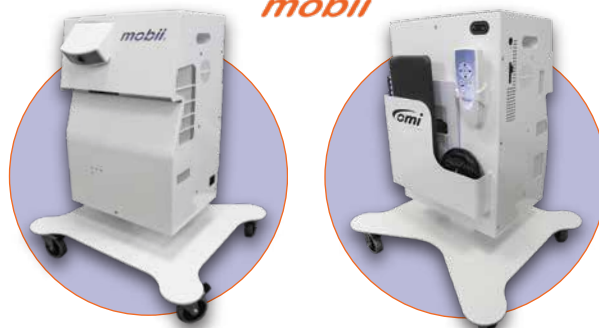
Portable and electrically height adjustable system projecting onto a table, bed or floor.