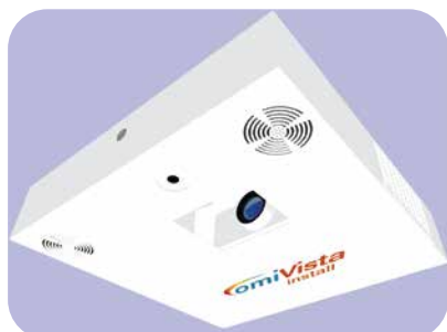
Fixed ceiling system projecting onto a floor or table.