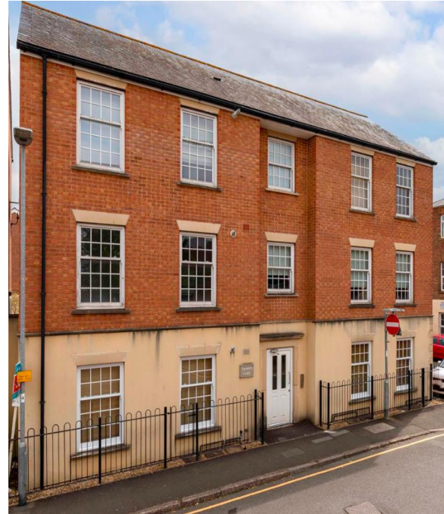
Tanners Court, Tancred Street.

Working with My Deposit Scheme – 5 weeks rent (£1,067.31) required on arrival 5-week cash deposit with My Deposits is required for these properties – Zero Deposits considered on a case-by-case basis.