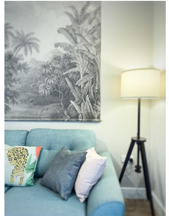
Example of finish and previous projects by Landlord.